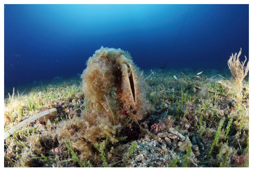
Figure 1 . Living pen shell Pinna nobilis in the concerned area off the south coast of Port-Cros Island, August 2020.

pen shells were observed between 23 to 27 m depth distributed over an area of approximately 1 000 m² (Table I). In the same area, 42 dead pen shells were observed (Fig. 2). The bottom is constituted of detritic sediment together with bryozoans and shell debris and free-living calcified red algae (Corallinales). This community is characteristic of Mediterranean detritic soft sediment exposed to deep-sea current. The colonization by the invasive green alga Caulerpa cylindracea Sonder is extensive (Fig. 2).