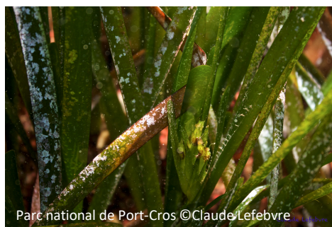
Neptune grass Posidonia oceanica