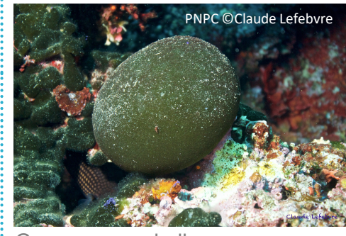
Green sponge ball Codium bursa